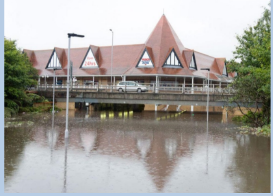
Figure 1 Purley Cross underpass (Croydon, 2015)

The River Wandle is a main river which runs through Wandle Park before entering a culvert and flowing into the neighbouring borough Sutton. During this