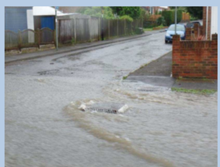
Figure 4 Surface water flowing onto Sites Hill Road