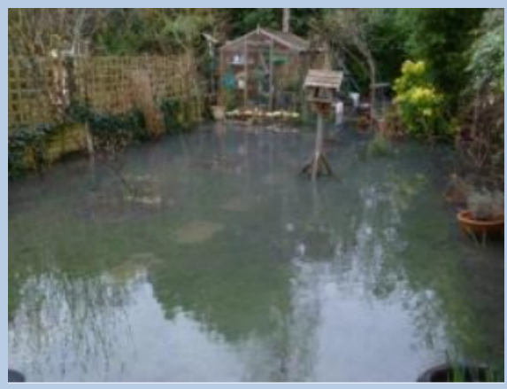
Figure 6 Flooded Gardens from Merstham Bourne (Croydon 2015)

The early 2014 flood events and the consequent emergency response led to successful internal collaboration between Croydon LLFA and various authorities as reported in the <u>Caterham Bourne Flood Investigation</u> (Croydon Council, 2014). The flood event saw the formation of the Caterham Bourne Project Board which consisted of officers from Corydon, Surrey, Tandridge, Environment Agency, Thames Water and SES Water, who collectively were responsible for overseeing delivery of the Caterham Bourne Flood Alleviation Study. The Croydon Resilience Forum (CRF) are a group of multi-agency responders who provide a forum for an integrated and coordinated approach to