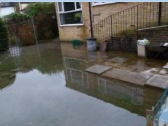
Figure 2 Flooded gardens during 2014 event (Croydon, 2015)

Further asset information gathering and actions to address flooding from ordinary watercourses have been included in the action plan for this strategy to aid future management. These include actions focussed on clarifying riparian responsibility and mapping ordinary watercourses to better manage the associated risks.